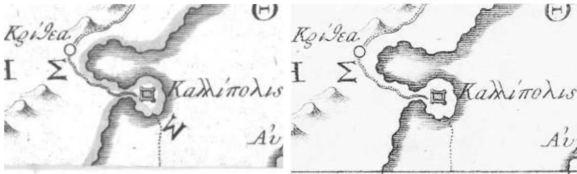
Version-B, sheet No. 8: letter “Σ”.