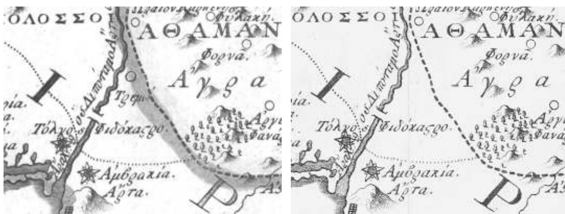
Version-B, sheet No. 5: toponym “Τρεμώ”.