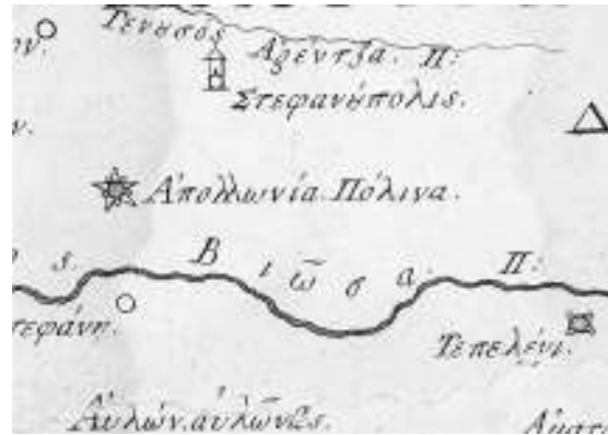
Version-A, sheet No. 7: road symbol missing.