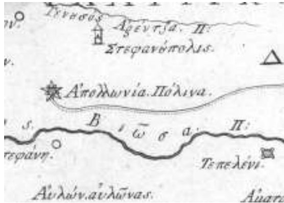
Version-B, sheet No. 7: road symbol below "Απολλωνία Πόλινα".