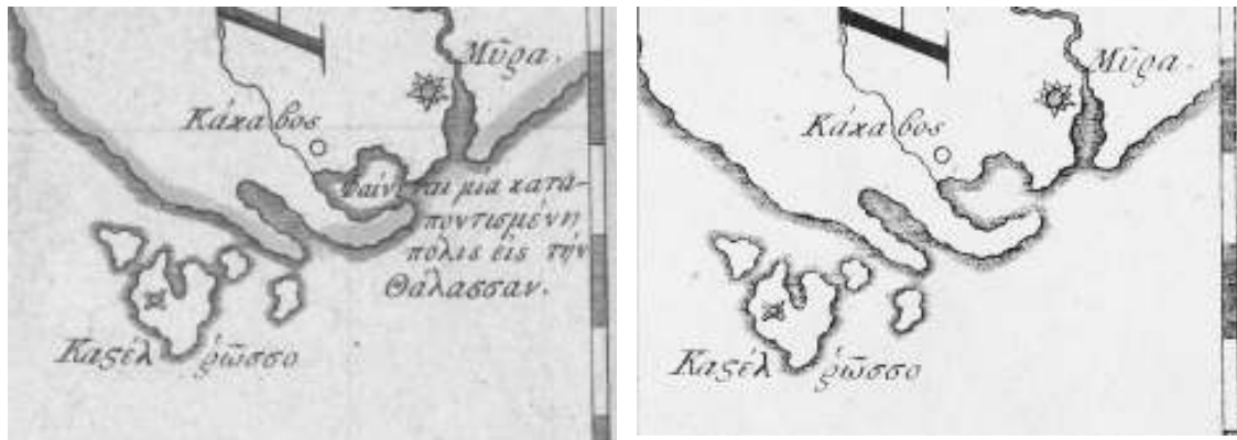
Version-B , sheet No. 3: text “Φαίνεται μία καταποντισμένη πόλις εἰς τὴν Θάλασσαν.”