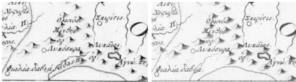
Version-B , sheet No. 5: toponym “νέδας. Π.”. The river above the toponym is traced differently.