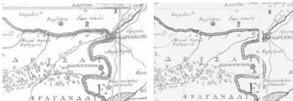
Version-B, sheet No. 9: toponym “Αρτίσκος Π.”.