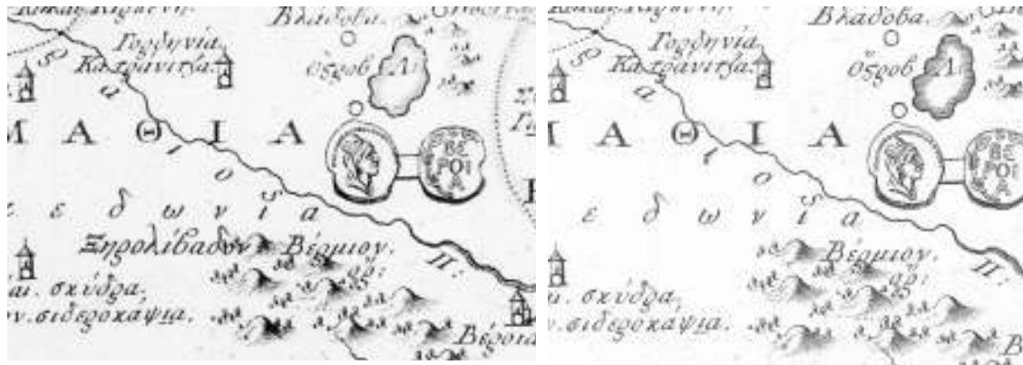
Version-B, sheet No. 8: toponym “Ξηρολίβαδον”.