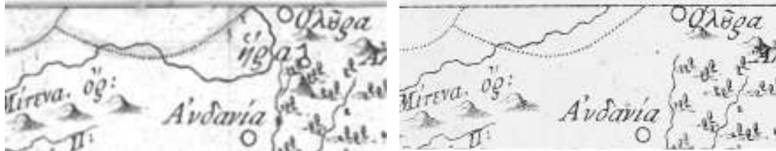
Version-B , sheet No. 2: toponym “ἦρα” with a mountain symbol below. The river is traced differently.