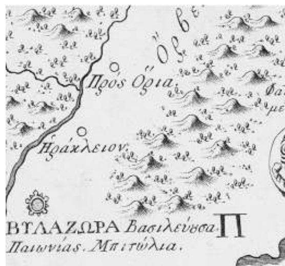
Version-A, sheet No. 8: toponym missing.