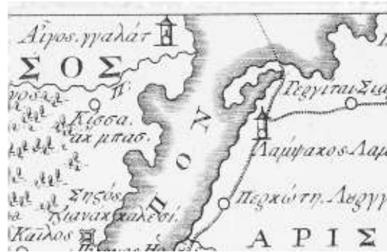
Version-A, sheet No. 6: toponym "ΠΙΟΝ" ("ΤΟ" is missing).