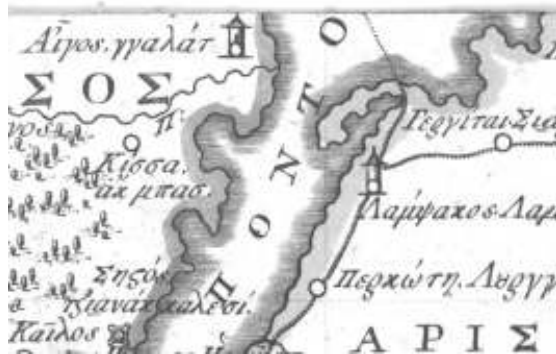
Version-B, sheet No. 6: toponym "ΠΟΝΤΟ".