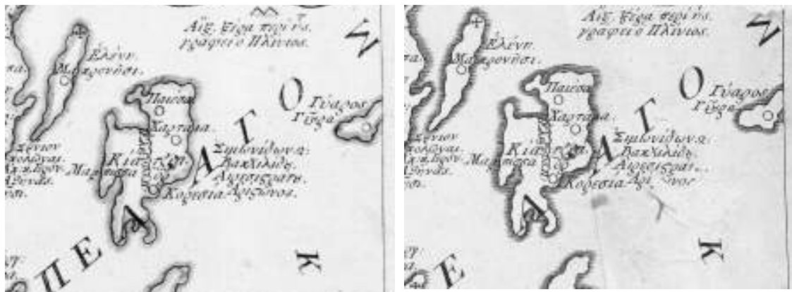
Version-B, sheet No. 5: toponym “ΠΕΛΑΓΟΣ”.