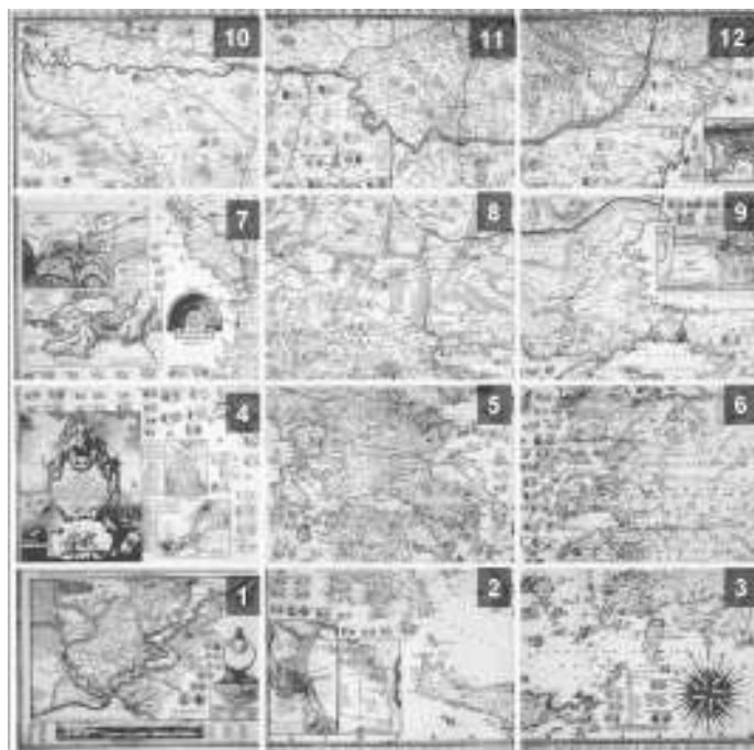
Figure 1: Rigas Charta . The 12 numbered map-sheets.

Version-B , as it is documented from the thirteen differences 3 detected in seven map-sheets (Fig. 2).