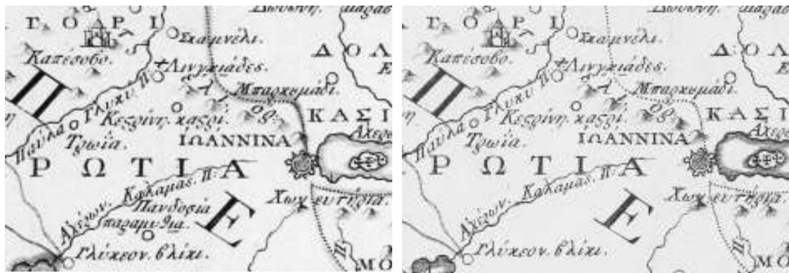
Version-B, sheet No. 5: toponym “παραμυθία Πανδοσία”.