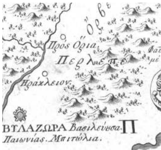
Version-B, sheet No. 8: toponym "Περλεπέ".